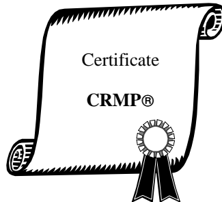
Certified Residential Mortgage PROCESSOR®