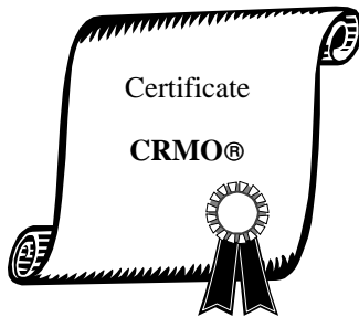
Certified Residential Mortgage ORIGINATOR®

Professional Designations available through AMLA, CMBA, NNMBA, or OMBA include: